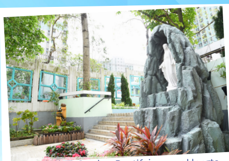
明心花園 Garden Rectifying our Hearts