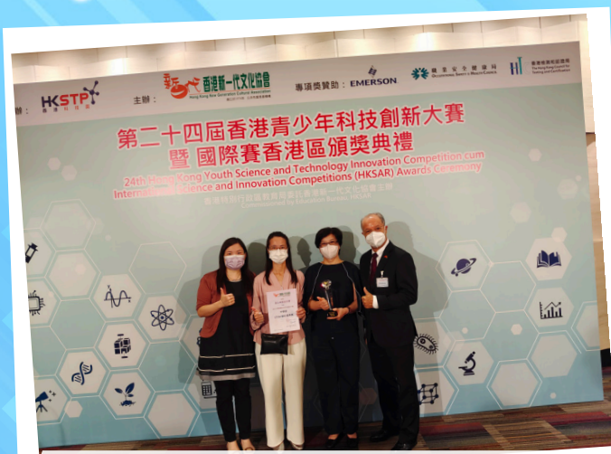
榮獲第 24 屆香港青少年科技創新大賽「優秀 STEM 學校優異獎」 Our school was awarded 'Outstanding STEM School' in the 24th Hong Kong Youth Science and Technology Innovation Competition.

STEM education has been the joint effort of Mathematics, Science and Information Technology KLAs. They have developed a variety of STEM learning activities and curricula, enhancing students' interest in learning scientific investigation and strengthening their integration ability as well as interdisciplinary knowledge and skills so as to solve problems in daily life. In Secondary 2 and 3, 1 lesson a week is dedicated to Project Learning. In Secondary 3, STEAM is the theme for the whole year. Students devise their own investigation topic or work on their inventions, where students apply knowledge from different subjects and develop creativity in order to tackle everyday life problems. In addition, students are taught many investigative methods, for example, nurturing creative thinking, conducting food tests and Microbit coding, etc. Such a curriculum can refine students' investigation effectiveness, equipping them with the ability to apply STEM.