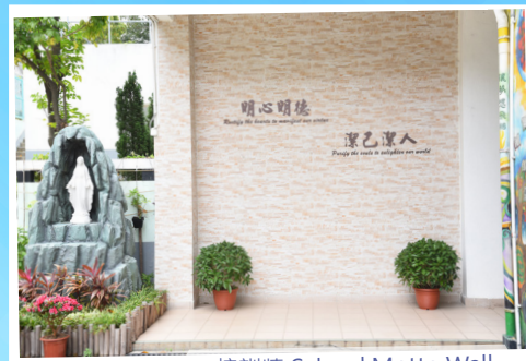
校訓牆 School Motto Wall