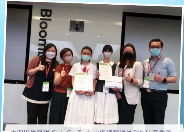
中四學生榮獲 Girls Go Tech 自學課程短片創作比賽季軍。 Form 4 students won the 2nd Runner-up in the Girls Go Tech Tutorial Video Competition.