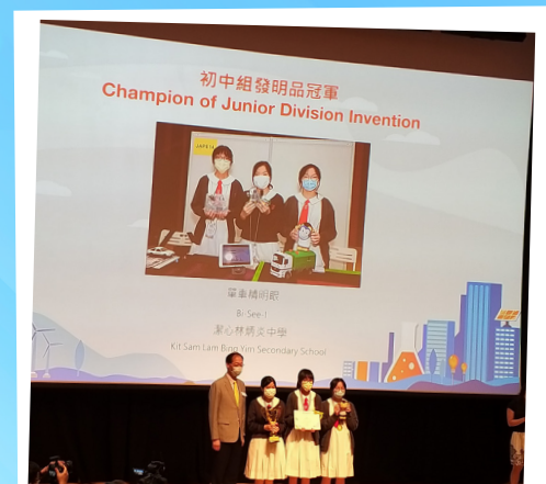
中三學生作品「單車精明眼」榮獲「香港學生科學比賽」初中組發明品組冠軍 'Bi-See-I' by Form 3 students won the Champion of Junior Division Invention of Hong Kong Student Science Project Competition.