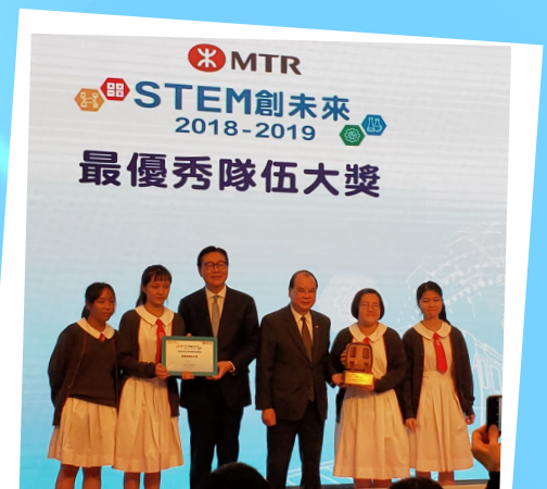
中四學生作品「『智』關愛車廂」於港鐵舉辦的「STEM 創未來」榮獲「最優秀隊伍大獎」 Form 4 students' 'Smart Carriage' won The Best Performing Team in the STEM Challenge organized by The MTR Corporation.