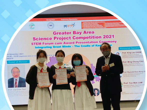
中六學生作品「Aqua Shelltic」榮獲「大灣區科技大賽」冠軍及最佳表現獎 Form 6 students' invention, 'Aqua Shelltic', won the Champion and Best Performance Award of Greater Bay Area Science Project Competition.