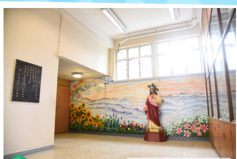
慈悲閣 Mercy Court