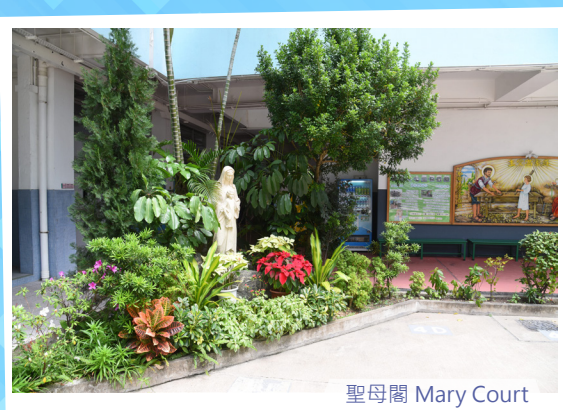
聖母閣 Mary Court